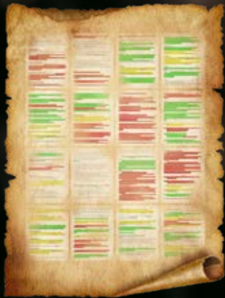
Above, A sample of the color-coded literature reviews from Cail's classes.

Cail's response? In true performer fashion, "Good! Yes! Tell your friends!"