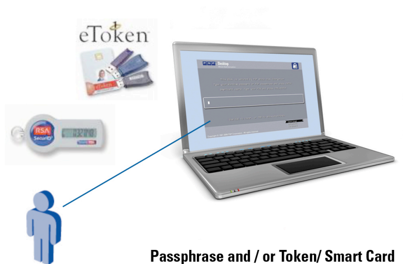
Figure 1: User authenticates with passphrase or smartcard/token

PGP Whole Disk Encryption software also provides the ability to encrypt removable storage media such as USB drives. When you insert an encrypted USB drive into a computer system, it prompts for passphrase, and upon successful authentication, you can use the USB drive.